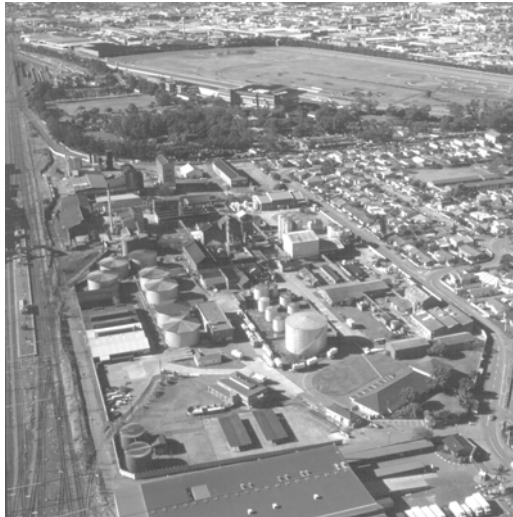
Figure 3: Merebank downstream plant near Durban, South Africa, with an ethyl alcohol production capacity of 40 million litres per year

costs required to up-grade boilers and/or generators for heat and power generation at sugar mills. Therefore, it is regarded as a promising option to take the opportunity to use Carbon Credits to kick-start co-generation in sugar mills operated by Illovo Sugar in Southern Africa [5].