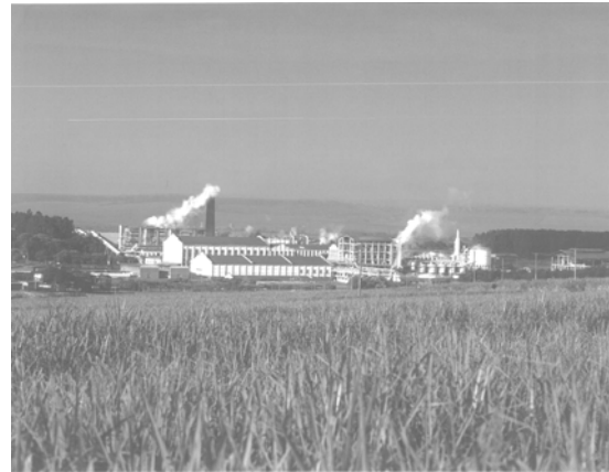
Figure 2: São Martinho sugar mill near the city of Pradópolis, State of São Paulo

will be implemented such as the creation of a global ethanol market with the involvement and commitment of a large number of countries. According to the Centro Nacional de Referência em Biomassa (CENBIO), Brazil, it will thereby be necessary to focus on large scale markets (e.g. bioethanol) in order to develop sustainable economies of emerging countries, whereas decentralised, small scale energy systems may contribute to the reduction of poverty in rural areas of the world [2].